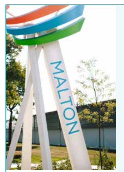
We are moving April 1st! Come see our new office location at Victory Hall.