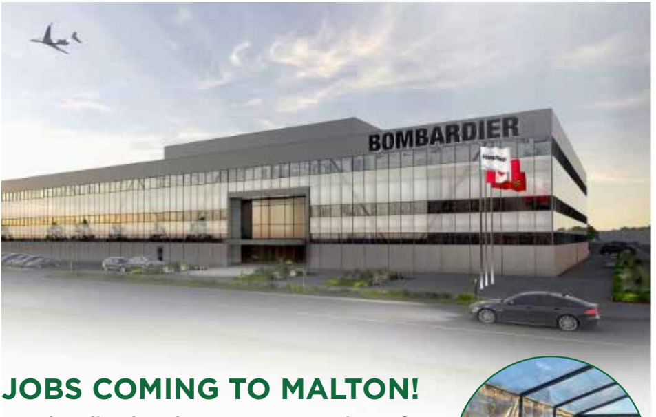
Mayor Crombie addresses Bombardier, welcoming them to Mississauga

Bombardier has begun construction of a new Global manufacturing centre right here in Malton. The massive steel-beamed skeleton can be seen on the Airport lands, seeming to stretch endlessly behind buildings parallel to Derry road. Construction of the behemoth is set to be completed in 2023.