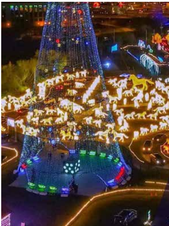
47 metres high with 28,000 LED lights

Special fund raising evenings for a wide variety of charities are part of Illumi’s support to our city. 400 employees will also be hired locally every season. We welcome Illumi!