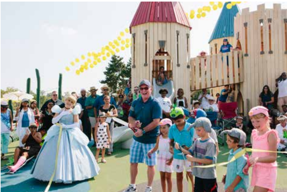
CASTLES CREATIVE PLAYGROUND in Malton. Lead sponsors Mitsubishi Heavy Industries (Canada) Aerospace and Longo’s

Preserving green space and developing parkland, with community input, is becoming more and more important as our City grows upward and develops more infill housing. Ward 5, with its heavy concentration of industry situated around the airport and along the 400 series highways, provides almost 25% of the tax revenue that is required to maintain and operate the City of Mississauga. Yet many of the projects and improvements we’ve made over the past eight years have required sponsorship through private sector fundraising. In fact millions of dollars have been raised to add spectacular playgrounds, design and build an AVRO Arrow replica, sponsor festivals and celebrations and convert a crumbling and abandoned indoor swimming pool into a $13.7 million youth hub. As a seasoned politician I have been able to draw a fair share of the City’s budget allocations back into Ward 5 for infrastructure as well as attract generous donors for many of the projects you see on these pages. We have many of the City’s most spectacular attractions right here in Ward 5!