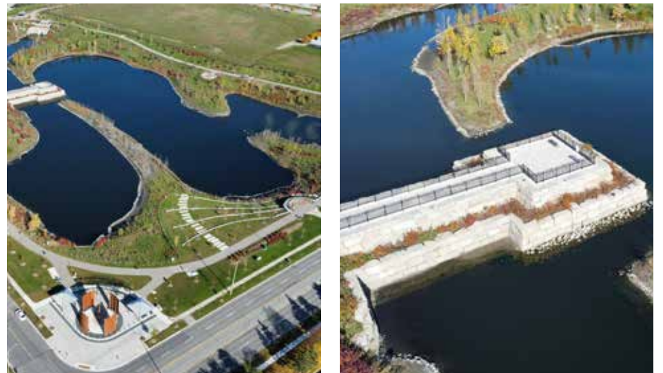
PLEASE ENJOY THE GORGEOUS DRONE PHOTOS TAKEN BY RESIDENT CHRISTIAN LANCTOT.

The official opening was delayed because of an oil spill that made its way into the storm water pond. A cleanup was completed before the pandemic moved the date even further ahead to the Spring of 2022. But the celebration is sure to be spectacular, with traditional fireworks reflected in the waters of the pond.