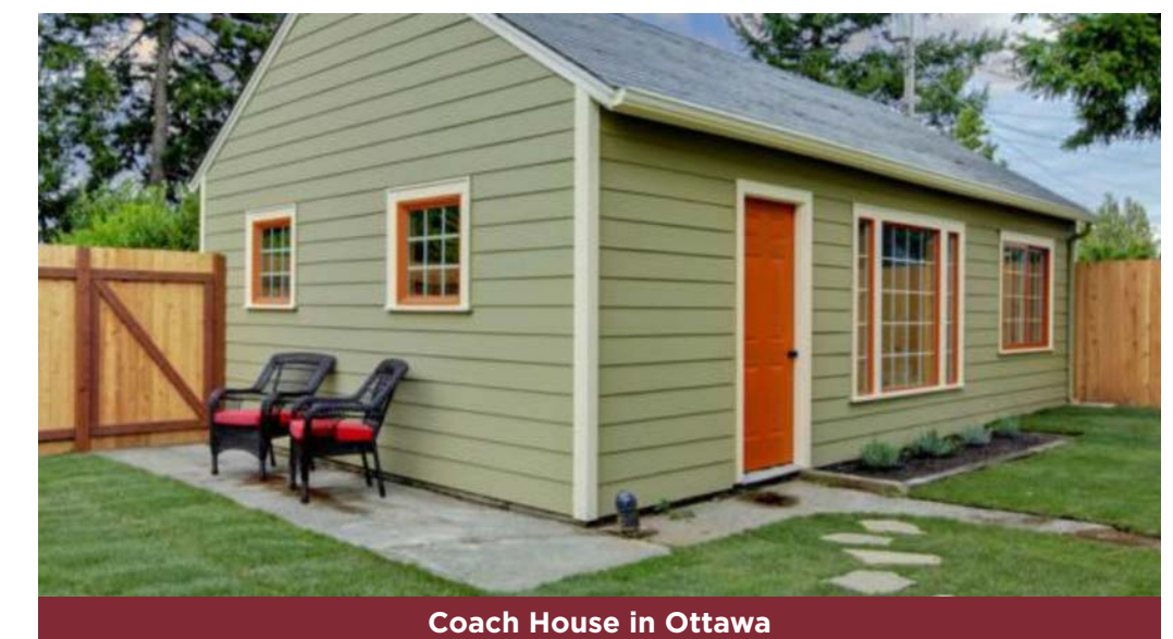
Coach House in Ottawa