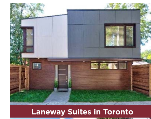
Laneway Suites in Toronto