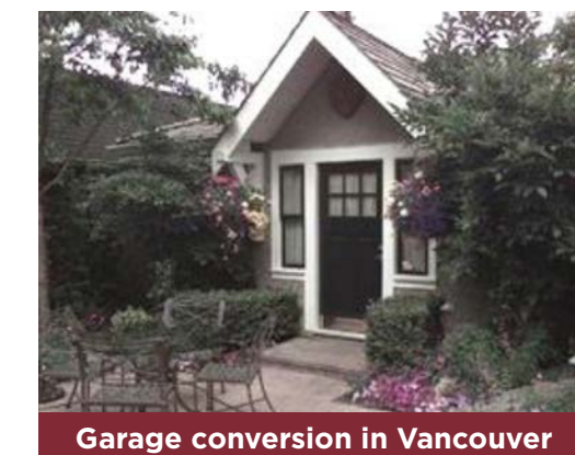
Garage conversion in Vancouver