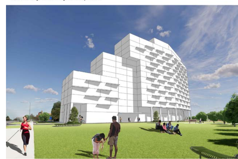
View looking north along Goreway Drive