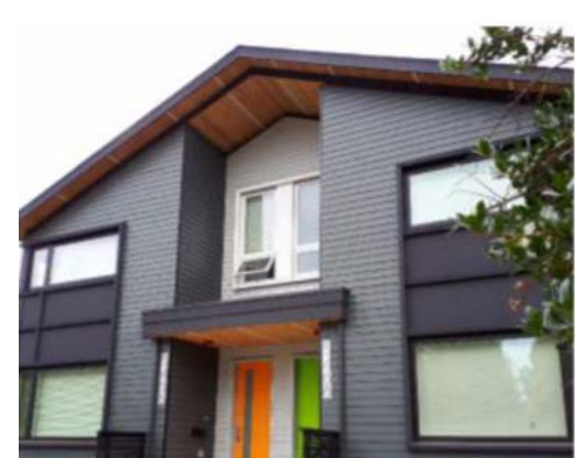
Multiplexes in Vancouver