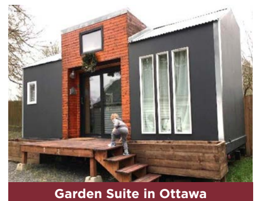
Garden Suite in Ottawa