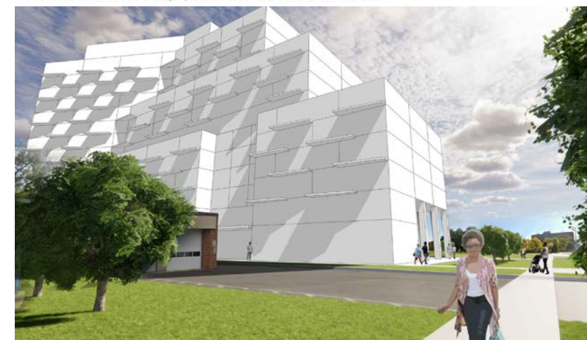
View looking south along Goreway Drive