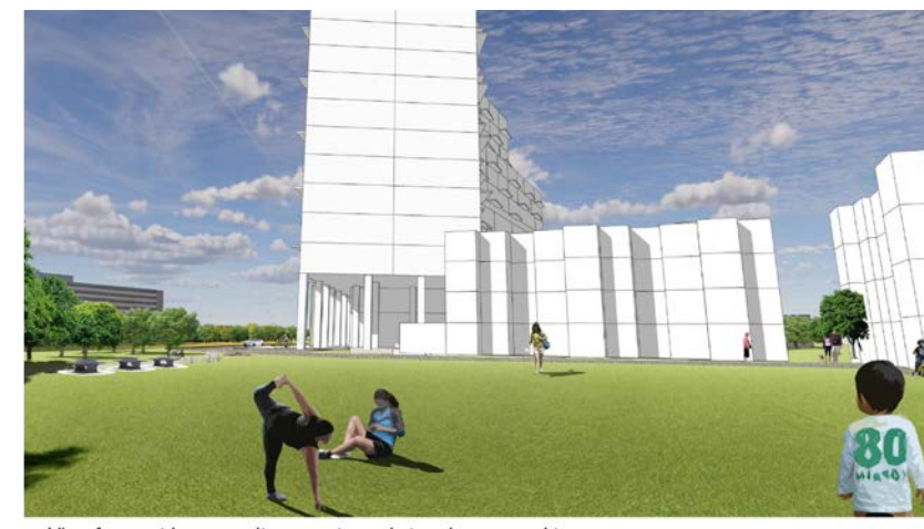
View from outdoor amenity space towards townhouses and tower